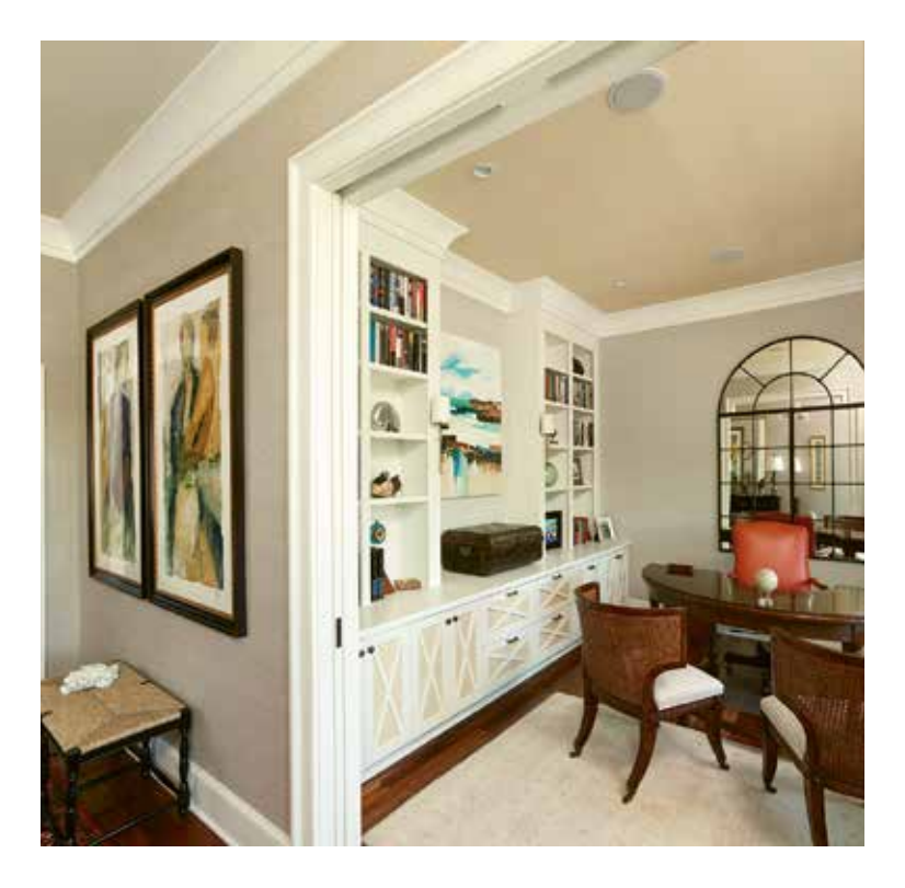
LEFT: In the dining area, the huntboard and its accessories tip off visitors that Ellen Kypta enjoys incorporating black into nearly every room. Cupboard from Coralberry Cottage. ABOVE: A pair of pocket doors provide sound-control for Richard Kypta's study, which overlooks the front porch. Chairs from Southeastern Galleries.

artwork that fills one side creates a gallery—totally offsetting the utilitarian personality of the opposite wall. "She hid the powder room, a stairwell, the laundry room and a coat closet all off the hallway," says Cobb. "It really opened up the floor plan."